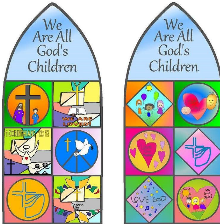
Left window panel drawings submitted by the children of the Manassas and Fairview congregations. Right window panel drawings submitted by the children of the Friendship congregation.